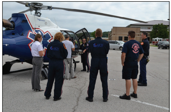
ARCH Medical crew members & CFD employees listen closely during the helicopter training.