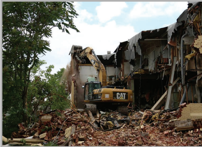
June 2, 2015 demolition progress Main Street Apartment Building -- W. Main Street

After many years of planning, demolition of the old Martha Manning Warehouse and Main Square Apartments began in mid May.