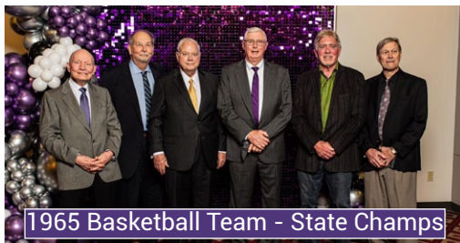
1965 Basketball Team - State Champs