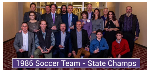
1986 Soccer Team - State Champs

The physical location of the Kahok Hall of Fame is on the CHS campus between Fletcher Gymnasium and the CHS Cafeteria. There are two touch panel screens that display a menu system where you can navigate to see photos and videos of HOF inductees. The virtual hall of fame is also accessible on the Collinsville CUSD 10 Kahok Hall of Fame website: https://kahokhalloffame.kahoks.org .