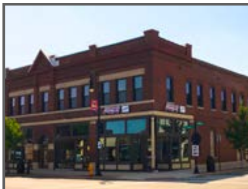
Mungo's Uptown at the corner of Main & Center