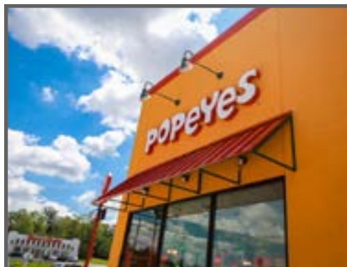
Popeye's Louisiana Kitchen on Rte. 157