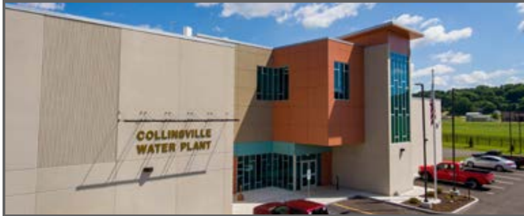
Collinsville's New Water Plant

The City received a low interest loan for the $20 million project through the Illinois Environmental Protection Agency's State Revolving Loan Program. The City also received $750,000 in loan forgiveness from the IEPA as well as $160,000 in Energy Incentives rebates through Ameren Illinois.