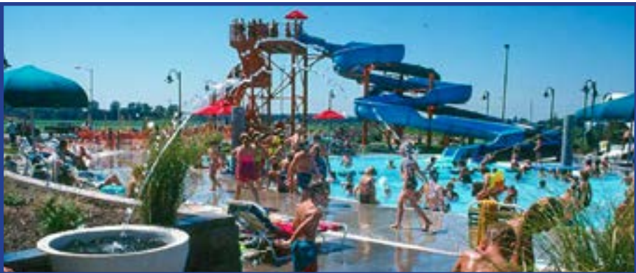
Collinsville Aqua Park · 10 Gateway Drive