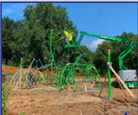
New playground construction at Schnuck's Memorial Park